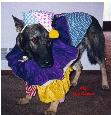
Amy the clown